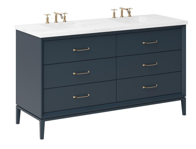
Image displaying a 60" vanity in Hague Blue with Satin Gold hardware. Countertop and faucet not included