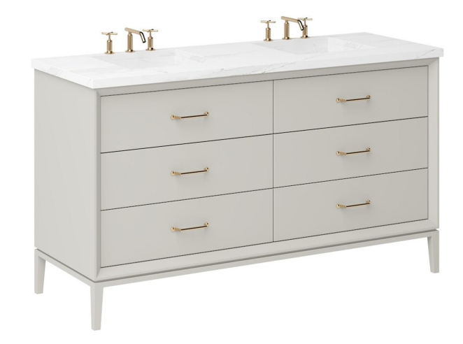
Image displaying a 60" vanity in Vintage Taupe with Satin Gold hardware. Countertop and faucet not included